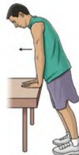
Wrist extension stretch

Stand at a table with your palms down, fingers flat, and elbows straight. Lean your body weight forward. Hold this position for 15 seconds. Repeat 3 times.