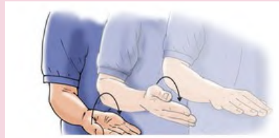
Forearm pronation and supination

Bend the elbow of your injured arm 90 degrees, keeping your elbow at your side. Turn your palm up and hold for 5 seconds. Then slowly turn your palm down and hold for 5 seconds. Make sure you keep your elbow at your side and bent 90 degrees while you do the exercise. Do 2 sets of 15