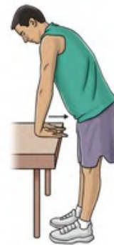
Wrist flexion stretch

Stand with the back of your hands on a table, palms facing up, fingers pointing toward your body, and elbows straight. Lean away from the table. Hold this position for 15 to 30 seconds. Repeat 3 times.